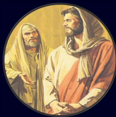
Jesus Tells The Parable Of The Good Samaritan