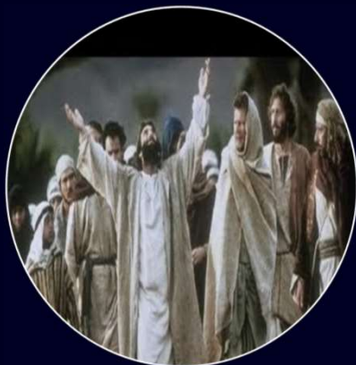
Jesus Sends Out The 72 - They Return With Joy