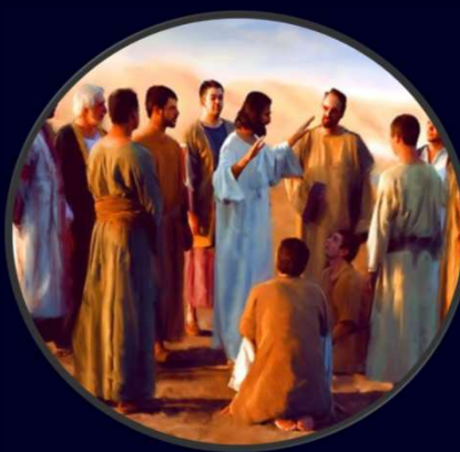
Jesus Rejoices In the Spirit With His Disciples