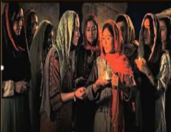
The Wise and Foolish Virgins