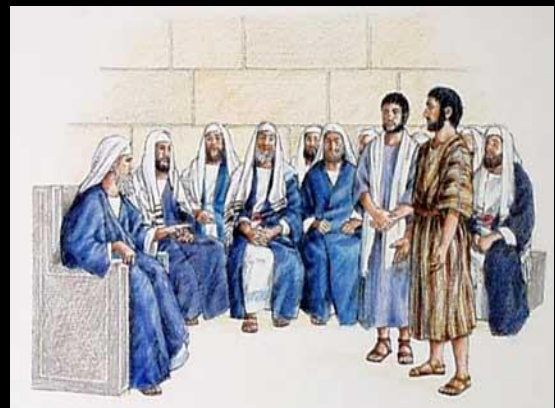
Peter and John On Trial Before the Sanhedrin